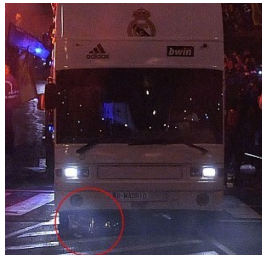
Have the Indian's been looking after the World Cup?